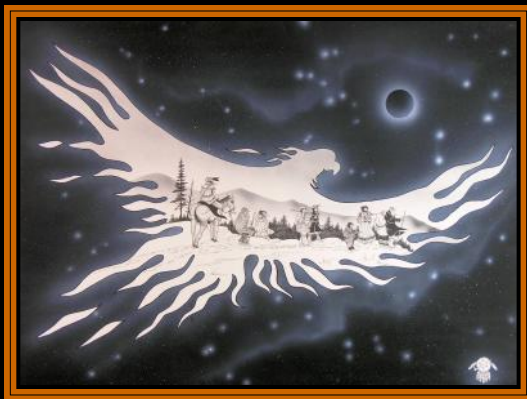
"OUT OF THE DARKNESS"

JUDGES CHOICE September 2017 Cherokee Homecoming Juried Art Show Tahlequah, Oklahoma