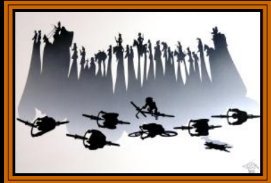
"REMEMBER THE REMOVAL BIKE RIDE"

Honorable Mention September 2017 Cherokee Homecoming Juried Art Show Tahlequah, Oklahoma