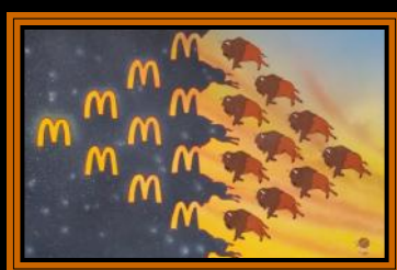
"FAST FOOD, THEN & NOW"

2nd Place April 8 - May 6, 2017 Trail Of Tears Juried Art Show Tahlequah, Oklahoma