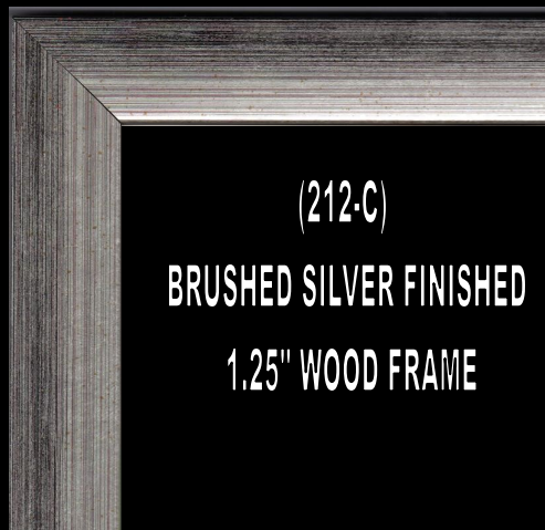
(212-C) BRUSHED SILVER FINISHED 1.25" WOOD FRAME