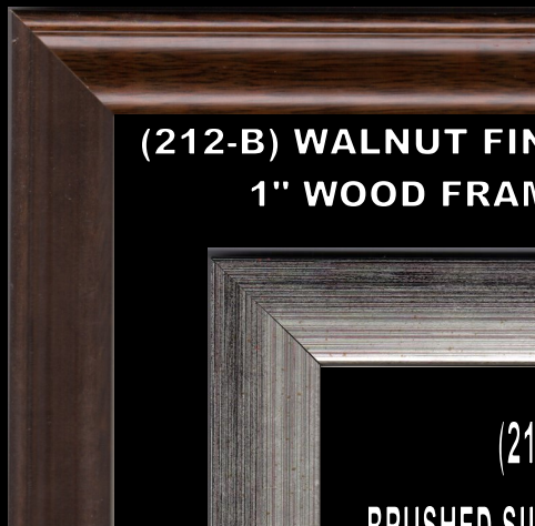
(212-B) WALNUT FINISHED 1" WOOD FRAME