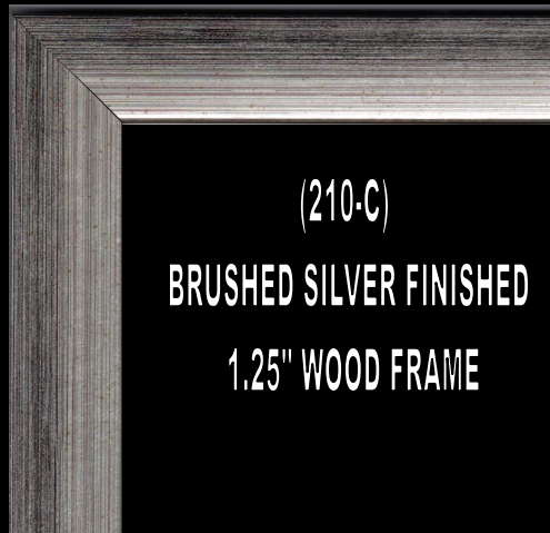
(210-C) BRUSHED SILVER FINISHED 1.25" WOOD FRAME