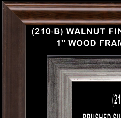
(210-B) WALNUT FINISHED 1" WOOD FRAME