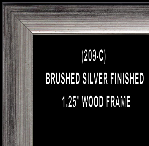
(209-C) BRUSHED SILVER FINISHED 1.25" WOOD FRAME