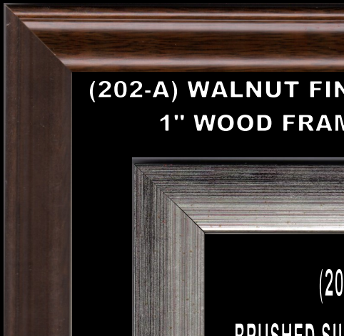
(202-A) WALNUT FINISHED 1" WOOD FRAME