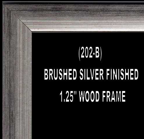
(202-B) BRUSHED SILVER FINISHED 1.25" WOOD FRAME

(3) Double Matted Giclee' Prints on 61# Acid Free Paper with Certificate of Authenticity.